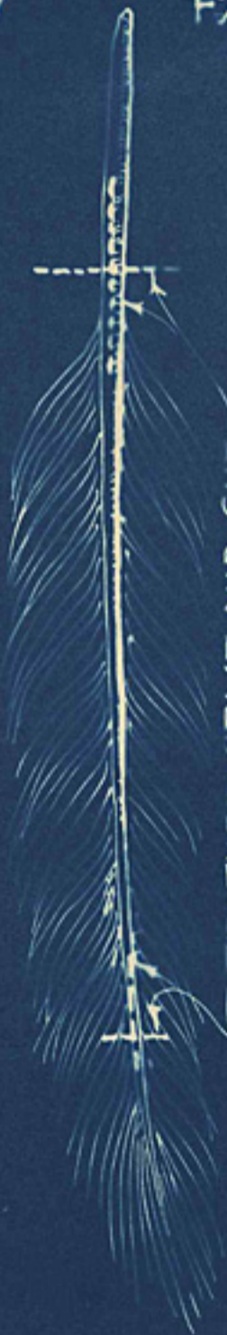
FEATHER SPLIT AND CUT