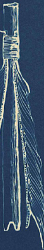
METHOD OF ATTACHING FEATHERS TO THE SHAFT