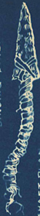
ARROW SHAFT PLAN AND A SECTION OF THE FEATHER PLACED ON THE SIDES